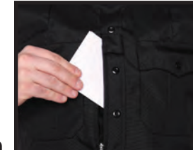
LARGE HIDDEN DOCUMENT POCKET