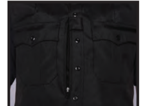
ZIPPER OPENING ON PLACKET